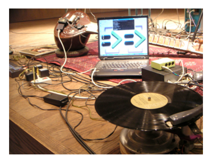
Figure 6. ESitar controller using ChucK to communicate with Trimpin's eight robotic turntables.

Experiments with the ESitar controller [6] using ChucK opened many new avenues for experimentation. As described in [6], the controller takes both the natural audio signal from the traditional instrument as well as control data from a variety of sensors and uses both streams to process and synthesize sound. Using ChucK program modules, we recorded synchronized audio and controller input and then played back the streams in ChucK to tweak parameters on-the-fly in the mapping algorithms until the desired effect was obtained. Experiments with comb-filters, delay lines, ring modulation, and controlling moog synthesizers all proved to be successful and straightforward to implement and control.